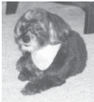
Little Munchie was best friend to our namesake, Dogster.

All of us who are animal lovers have been there before. Our pets are family, and their deaths leave huge holes in our lives. We are lucky if we can be there for them to the end, caring for and comforting them.