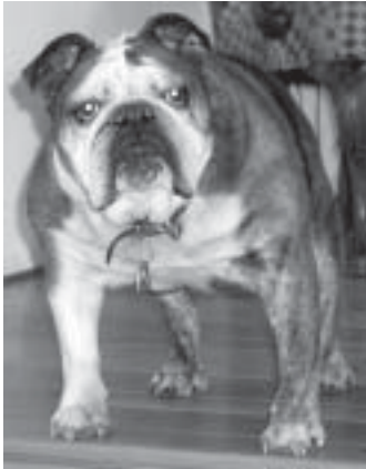
El Rancho del Perro Feo will not be the same without its namesake, Emma.

All of us at D-SNIPI feel the loss of these two special creatures, and are reminded by their passing to enjoy the time we are able to share with our own pets.